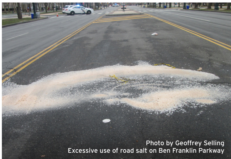
Excessive use of road salt on Ben Franklin Parkway